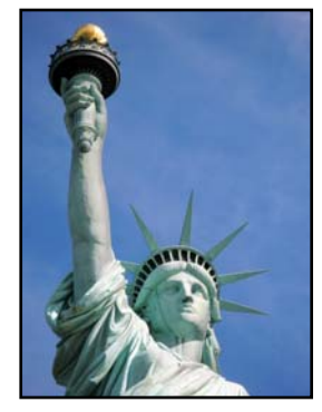
People from every country in the world have moved to the United States.