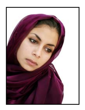
Be careful not to stereotype people based on their appearance or clothing.

• Example: Most white Americans value privacy, especially when they are sick. Often, they will pay more for a private room in a hospital and probably want to have a lot of private time. However, people from other cultures—such as Asians and Hispanics—tend to stick closely to sick family members. They put more value on the strength of the family than they do on privacy.