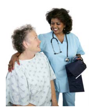
Every person has the right to receive courtesy and respect from others.