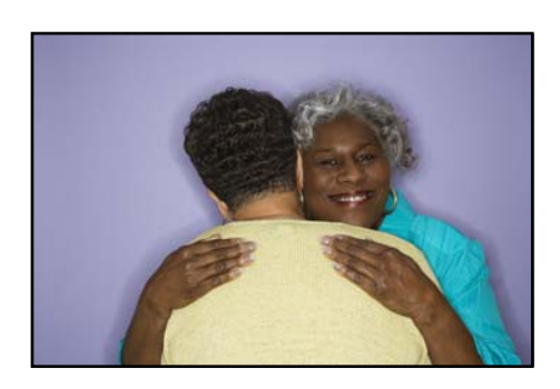
African Americans tend not to be concerned about dementia until the symptoms are advanced.

medical diagnosis of dementia to describe someone's condition, some African Americans prefer to use terms like "his