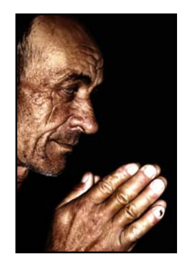
People in many cultures rely on faith healers rather than physicians to cure their illnesses.